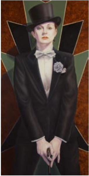
Emcee, 2008 Oil on canvas 36 x 18 x 7/8