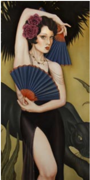
Fan Dancer, 2008 Oil on canvas 36 x 18 x 7/8